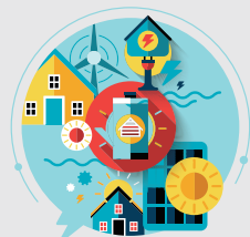
ACCESS CLEAN ENERGY PRODUCTS FOR HOUSEHOLD