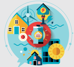
ACCESS CLEAN ENERGY PRODUCTS FOR HOUSEHOLD