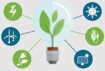
SUSTAINABLE CLEAN ENERGY