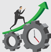
INCREASED PRODUCTIVITY IN THE FARM DUE TO REJUVENATED WORKERS